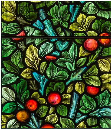
Stained Glass on Holy Island, Anglesey

Dydd Sadwrn 1 Gorffennaf 2023 Saturday 1 July 2023